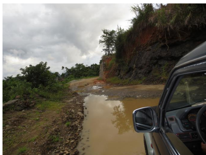
The road to Pantikian